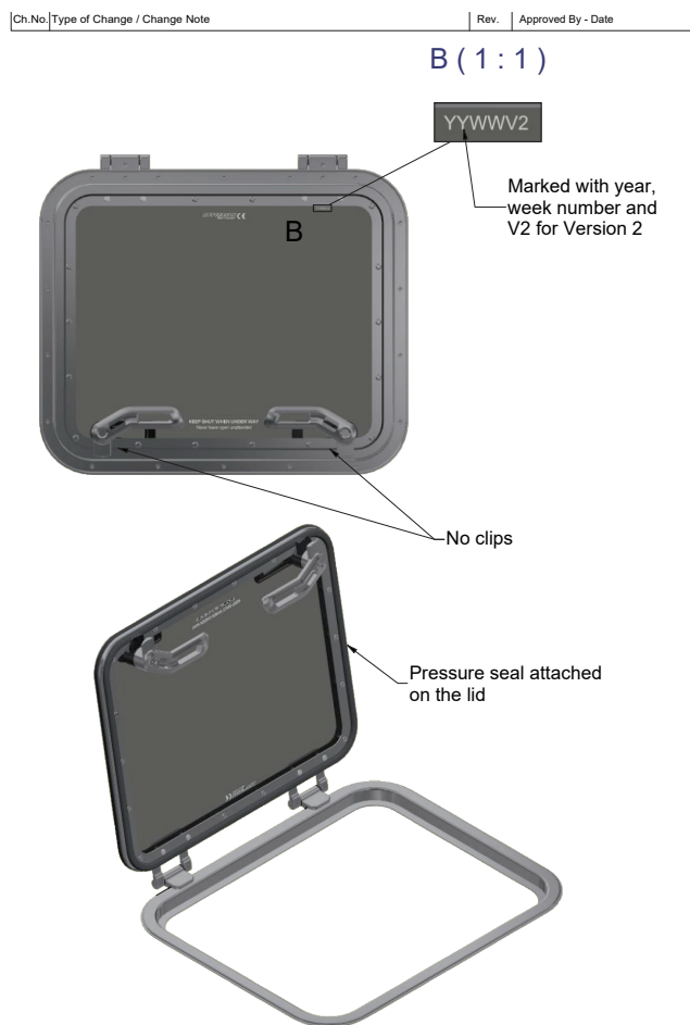
Multihull Escape Hatch H2255-5400 Version 2, from April 2021

Designed and manufactured under one roof in Marstrand, Sweden