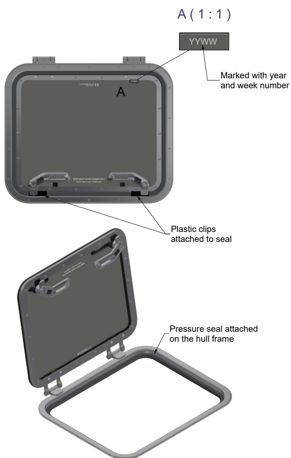
Multihull Escape Hatch H2255-5400 Version 1, until March 2021

© RUTGERSON MARIN AB. Copying, distribution and utilization of this document as well as the communication of its contents to others without expressed authorization is prohibited. Offenders will be held liable for payment of damages. All rights reserved in the event of the grant of a patent, utility model or ornamental design registration.