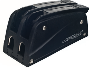
S600702 / S600712