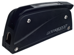
S600701 / S600711