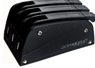
S600703 / S600713