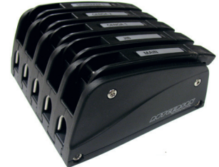
S600705 / S600715