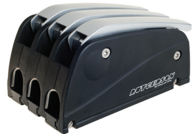
S601203 / 601213