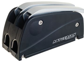
S601202 / 601212