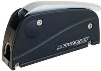
S601201 / S601211