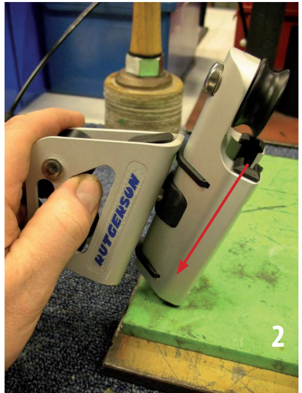
2. Tap the traveller gently on a wood (or "semisoft") surface. The axle that holds the upper part of the traveller should start to come out.