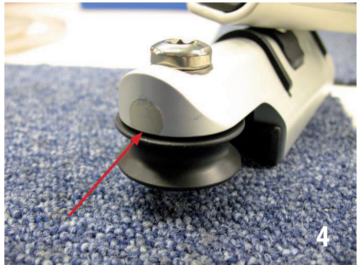
4. Sometimes the axle gets stuck and won't come out. In case this happens you can take away the plunger or sheave and drill a 3 mm hole on the other side, opposite to the axle and use a punch to get it out.